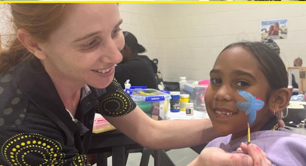
Palm Island Early Years Reference Group